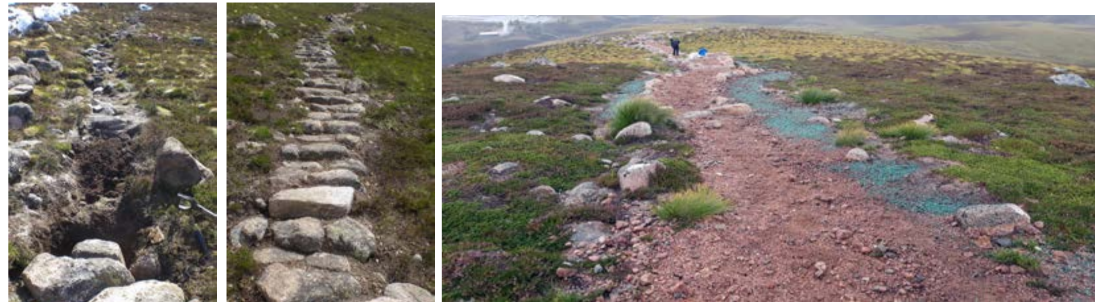
Before & after path pitching construction (2013 / 2014)